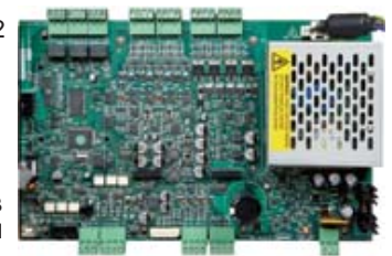
AX-CTL-2PCB Base Card

AX-SEB: Axis AX Series RS-232 Serial Expansion Board. Use with D9068P Communicator.