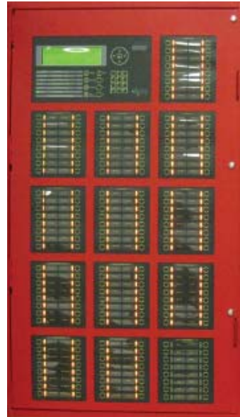
CCM-02-BB Backbox CCM-02-ID2 Inner Door CCM-02-OD Outer Door