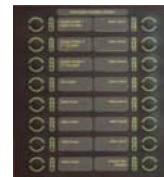
AX-ASW-16 Switch Card

As our policy is one of constant product improvement the right is therefore reserved to modify product specifications without prior notice.