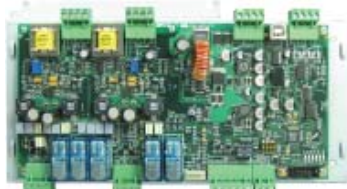
AV-AMP-80 Audio Amplifier

AV-AMP-80: Audio Amplifier Module includes built-in 16 message generator, dual booster inputs and two 40 watt, 25 Vrms speaker outputs. Includes mounting plate and mounting hardware. The smaller Modular Command Center will support one amplifier, the larger Modular Command Center will support two amplifier modules.