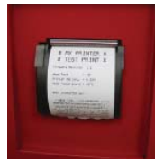
AX-012 Strip Printer

AX-DAP: Double aperture blank metal plate. Comes with mounting hardware.