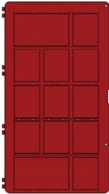
CCM-02-ID2 Inner Door