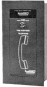
FB-300 FB-301 FC-300