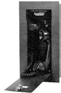
FT-301 FT-302 FT-301C FT-301CL