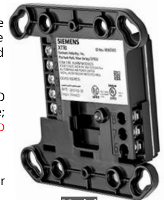
Model XTRI-D | XTRI-R | XTRI-S Intelligent Device Interface Module

This single-input interface module can only monitor and report the status of a N.O. or N.C. contact.