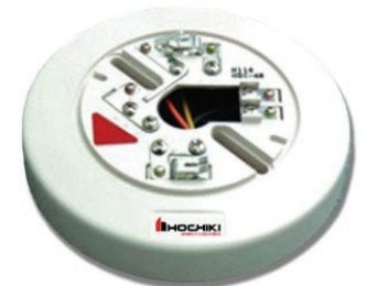
6" Base with Relay