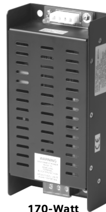
170-Watt power supply