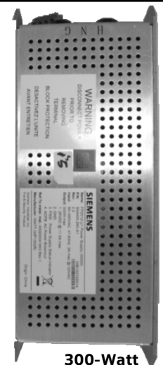
300-Watt power supply