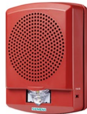
Model SLFSSWR-N Sounder-strobe