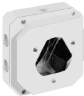
Prism Reflector (Model PBR-1191)

The retroreflecting prism of Model PBA-1191 has the shape of a pyramid whose lateral faces are formed by isosceles orthogonal triangles. Light entering through the base is completely reflected twice on the lateral faces and reflected back through the base. The base is equipped with a reflector heater. If condensation is possible, the heater should be connected to a 24V supply.