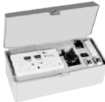
Detector Adjustment Kit (Model PBL-1191)

The detector adjustment kit (Model PBL-1191) is required for proper electrical adjustment and mechanical alignment of Model PBA-1191.