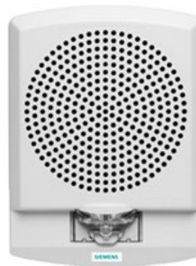
Model SLFSSWW-N Sounder-strobe

The inclusive trim plate makes for easy installation for retrofit projects that already have backboxes installed. The `SL'-series is apt for indoor wall-mount applications. Moreover, the Series `SLFS' and `SLFSS' models, which operate on 24VDC, are designed specifically for indoor, wall-mount applications.