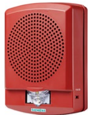
Model SLFSSWR-N Sounder-strobe