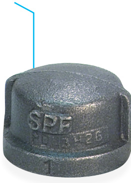
Cap Fig. 3224