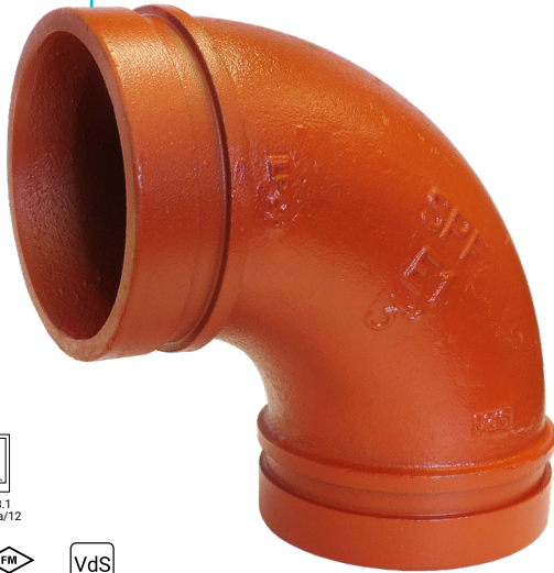
90° Elbow Fig. E-1