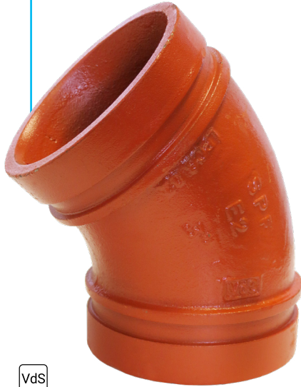
45° Elbow Fig. E-2