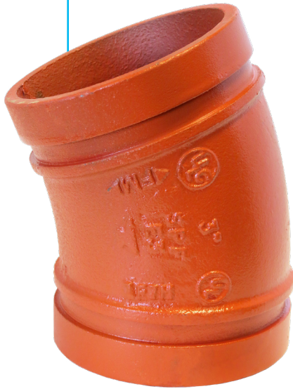
22½° Elbow Fig. E-3