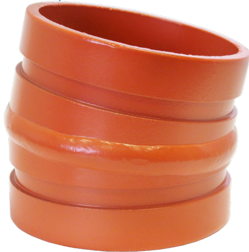
11¼° Elbow Fig. E-4