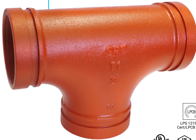
Straight Tee Fig. T-1