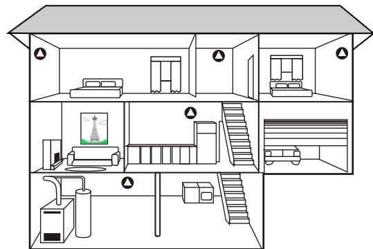
Figure 1: Recommended CO detector locations