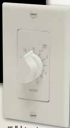
Wallplate not included