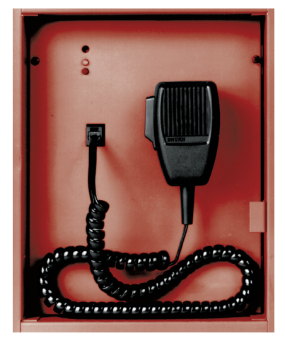
PVX-RM Shown With Cabinet Door Removed