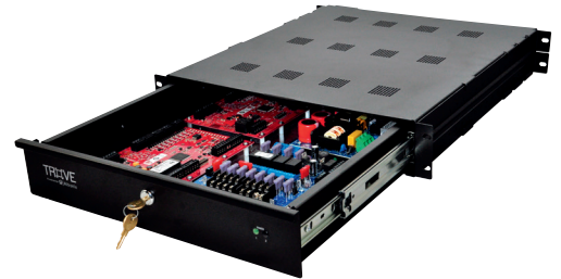
Trove1M1R with Altronix power supply and sub-assemblies and Mercury controllers