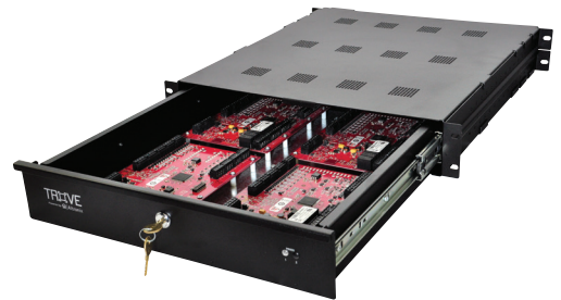
Trove1M1R with Mercury controllers