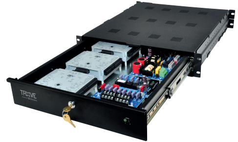
Trove1V1R with Altronix power supply and sub-assemblies and three (3) HID VertX® (or Aero™) access controllers