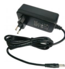
DC12V/3A Power Supply