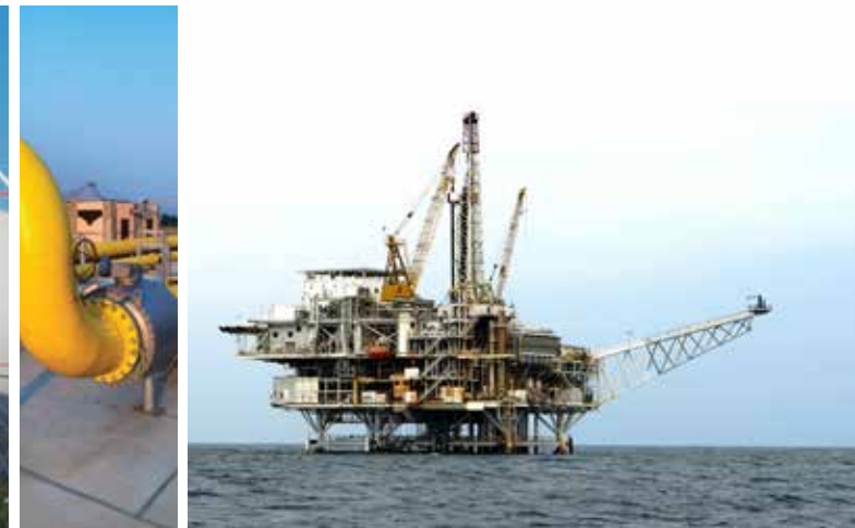
Solutions are tested before being commissioned