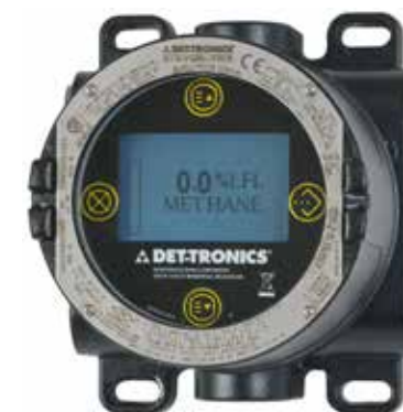
FlexVu® UD10 Universal Display