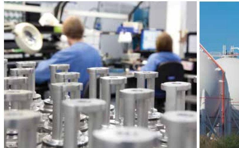
Each product is tested prior to leaving the factory