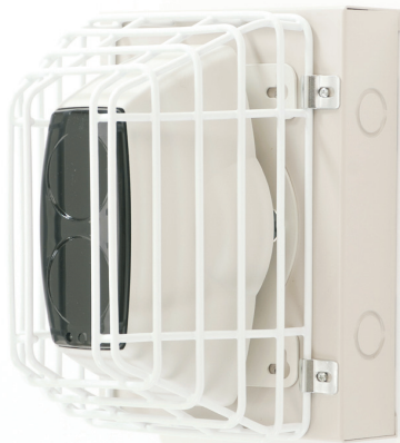
Mounted on a 0608 Surface Mount Back Box