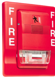
Genesis Chime-strobe with optional trim plate

Genesis chimes and strobes mount to any standard one-gang surface or flush electrical box. Matching optional trim plates are used to cover oversized openings and can accommodate one-gang, two-gang, four-inch square, or octagonal boxes, and European 100 mm square.