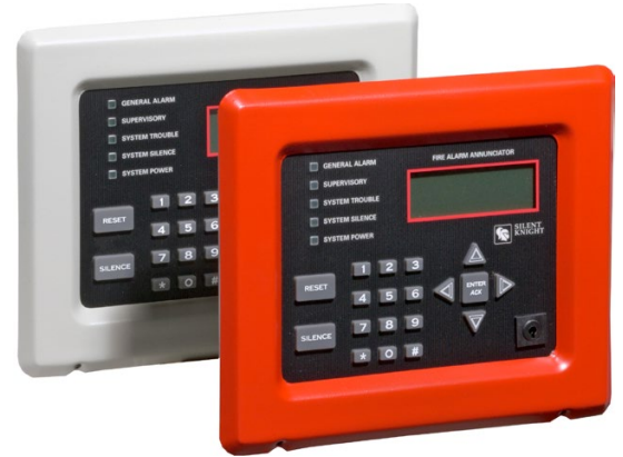
RA-1000R / RA-1000