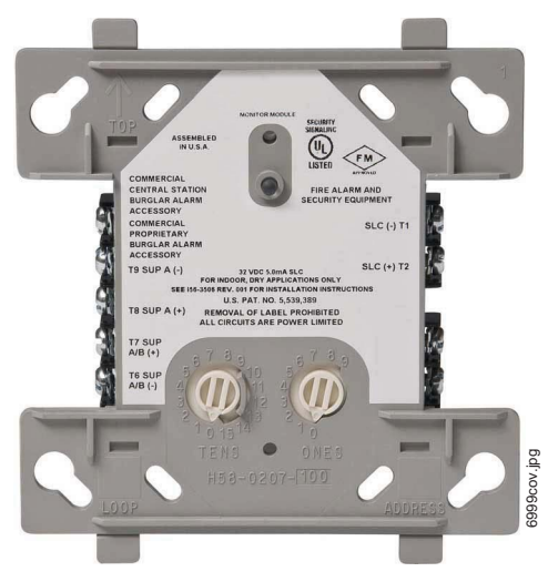
FMM-1(A) (Type H)

Use to monitor a zone of four-wire smoke detectors, manual fire alarm pull stations, waterflow devices, or other normally-