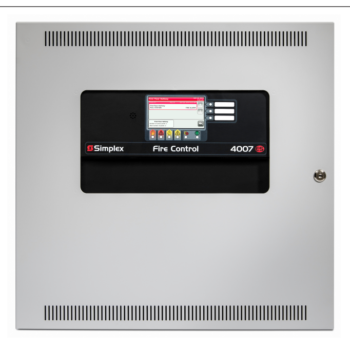
Figure 1: 4007ES Hybrid Unit front view