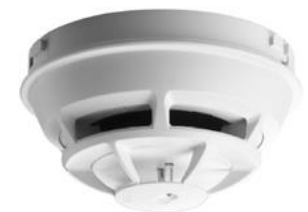
Model OH921 Multi-Criteria Fire Detector

Each Model OH921 detector provides three (3) pre-programmed parameter sets that can be selected by the FACP.