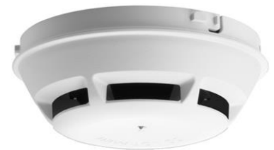
Model OP921 Photoelectric Smoke Detector

The smoke chamber is designed to manage light dissipation and extraneous reflections from dust particles or other non-smoke, airborne contaminants in such a way as to maintain stable, consistent detector operation. When smoke enters the detector chamber, light emitted from the IRLED is scattered by the smoke particles and is received by the photodiode (see: images on page 2).