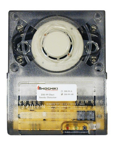
Duct housing with an ALK-D digital analog photoelectric sensor.