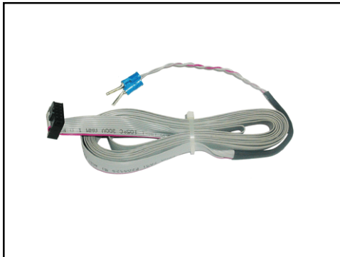
FN-V187 VoiceNET Serial Interface Cable