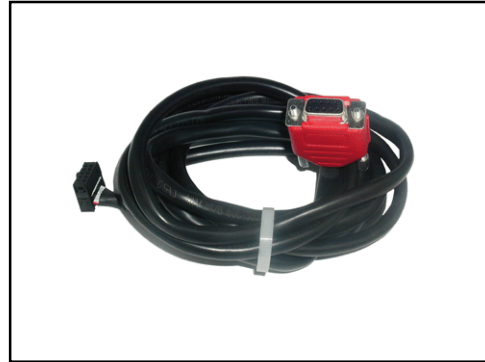
S187 Programming Cable