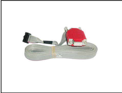
X187 Programming Cable