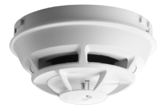
Model FDOT421 Multi-Criteria Fire Detector

The signal processing with detection algorithms allows the detector to first gather smoke and thermal data, and then analyze this information in the detector's 'neural network.' By comparing data received with the common characteristics of fires or fire signatures, Model FDOT421 can compare these signals to those of deceptive phenomena that cause other detectors to trigger a false alarm.