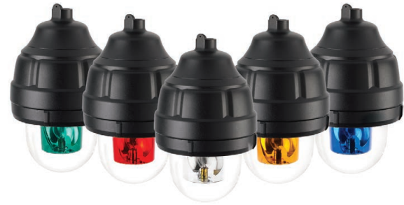
(Shown with pendant mount. See how to order for mounting options)