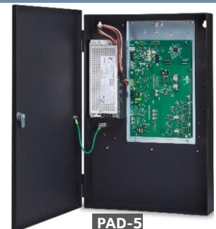
Typical 1HU enclosure configuration