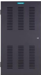
PAB2-ENCL 2 HU Enclosure