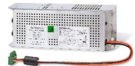
FP2012-U1 (up to 300W)