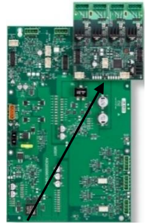
Model PAD-5-CDC Mounted to a PAD-5-MB Main Board

Each Model PAD-5-CDC supports Siemens and other-branded smoke detectors, as well as one (1) beam detector per zone. Additionally, Model PAD-5-CDC provides optional alarm verification by circuit, as well as consistent ground fault detection.