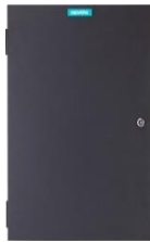
PAB-ENCL 1 HU Enclosure

A red version of each enclosure is also furnished: Model PAB-ENCL-R for the 1HU enclosure and Model PAB2-ENCL-R for the 2HU enclosure.