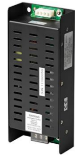
FP2011-U1 (up to 170W)

Additionally, the power supplies can recharge and maintain backup charge for the two (2) back-up batteries. The 170W power supply, Model FP2011-U1, can provide battery-backup charge of 7A (up to 35AH), and the 300W power supply, Model FP2012-U1, provides battery-backup charge of 35AH (up to 100AH)