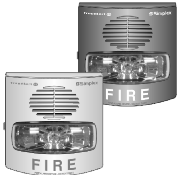
Figure 1: TrueAlert ES Addressable Chime-Strobe covers are available in red and white with a variety of lettering for applications

This product has been approved by the California State Fire Marshal (CSFM) pursuant to Section 13144.1 of the California Health and Safety Code. See CSFM Listing 7135-0026:0334 for allowable values and/or conditions concerning material presented in this document. Additional listings may be applicable; contact your local Simplex product supplier for the latest status.