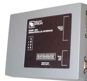
5824 Serial/Parallel Gateway Module