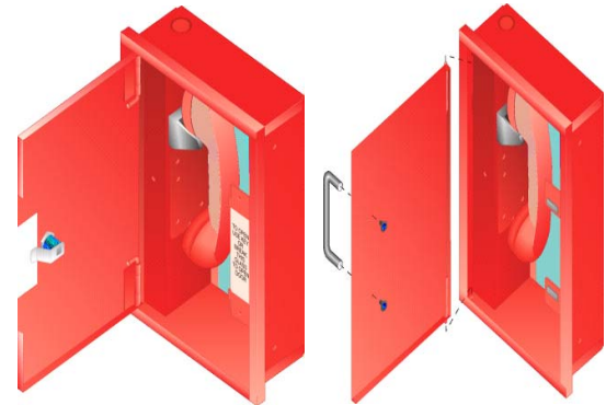
ETC with Key Lock Latch ETC with Pull Handle Magnetic Latch