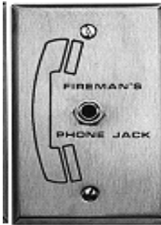
Figure 2 FPJ

The receptacle is semi-flush mounted with a single-gang box (the box is not furnished with a receptacle). The receptacle has a single phone jack mounted on an attractive, single-gang, stainless steel plate. Color-coded wires, 6 inches (15.2 cm) long, are pre-wired to the jack to enable fast and accurate wiring to the system.