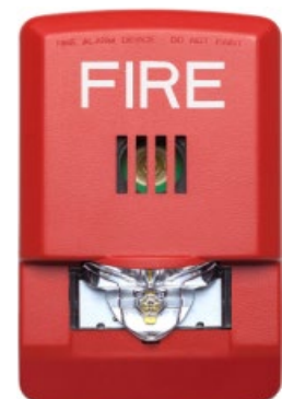
Model SLHSWR-F Horn-Strobe