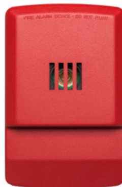
Model SLHR-N Horn

The `SL'-series is apt for indoor wall-mount applications. The Model `SLH'-series horn appliances work in either 12V or 24VDC, whereas the Series `SLSW' and `SLHSW' strobe and horn-strobe devices are specifically for 24V operation.