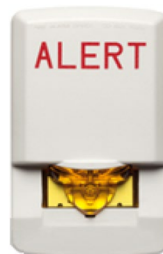
Model SLSWW-ALA Strobe