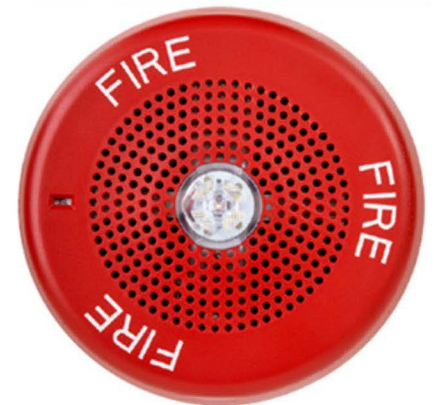
Model SLSPSCR-F High-Fidelity Speaker-Strobe