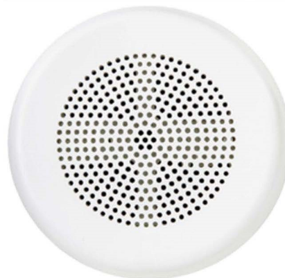
Model SLSPCW-N High-Fidelity Speaker

This series of `SL'-series appliances is specific to indoor, ceiling-mount applications. Each model incorporates a front-end, snap-on grille cover, and mounts to standard electrical hardware. Therefore, no additional trim plate or adapter is required.