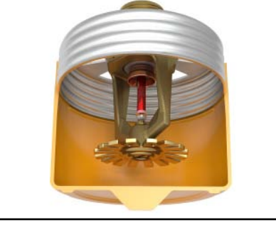
Concealed Sprinkler and Adapter Assembly with Protective Cap

Concealed Sprinkler and Adapter Assembly (Protective Cap Removed)