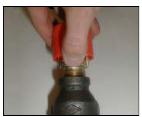
Figure 3: Sprinkler cap being removed from and upright sprinkler.