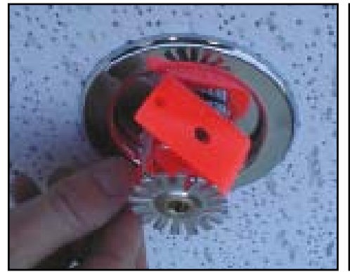
Figure 1: Sprinkler shield being removed from a pendent sprinkler.

SHIELDS AND CAPS MUST BE REMOVED FROM SPRINKLERS BEFORE PLACING THE SYSTEM IN SERVICE!