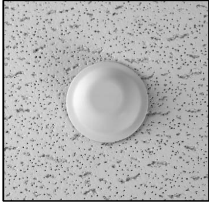
Cover Plate Assembly (Pendent Cover 12381 shown)

Concealed Sprinkler and Adapter Assembly (Protective Cap Removed)