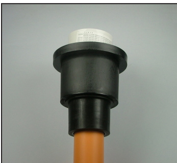
Figure 1: Attach the tool to the end of the CPVC pipe.

WARNING: Cancer and Reproductive Harm- www.P65Warnings.ca.gov