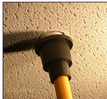
Figure 3: Press the escutcheon cup onto the adapter until the flanges touch the ceiling.