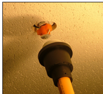
Figure 2: Place a Model E-1 or F-1 escutcheon cup in the installer tool and use the tool to install the cup onto the sprinkler and adapter.