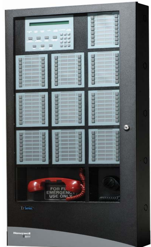
E3 Series Broadband