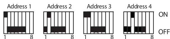
Figure 2 Set the RS-485 address

Note: You must set the RS-485 address even if you are not using RS-485.