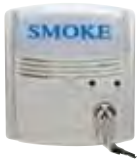
RTS2 Multi-signaling accessory without strobe 20-29 VDC; UL S2522