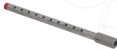
DST Sampling Tubes DST1 - ducts up to 1 foot DST1.5 - ducts 1 to 2 feet DST3 - ducts 2 to 4 feet