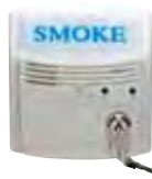
RTS2-AOS Multi-signaling accessory with add-on strobe 20-29 VDC; UL S2522