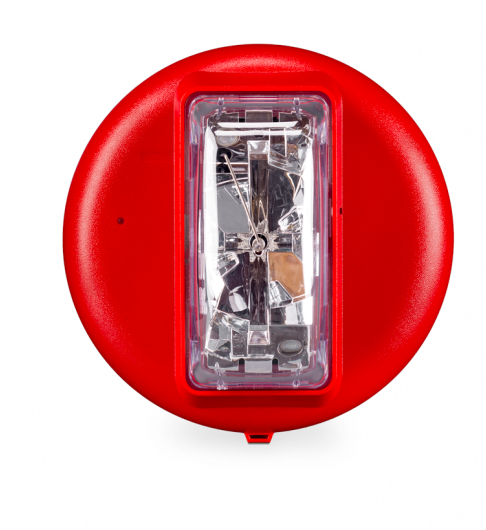
Figure 1: TrueAlert ES Addressable Strobe