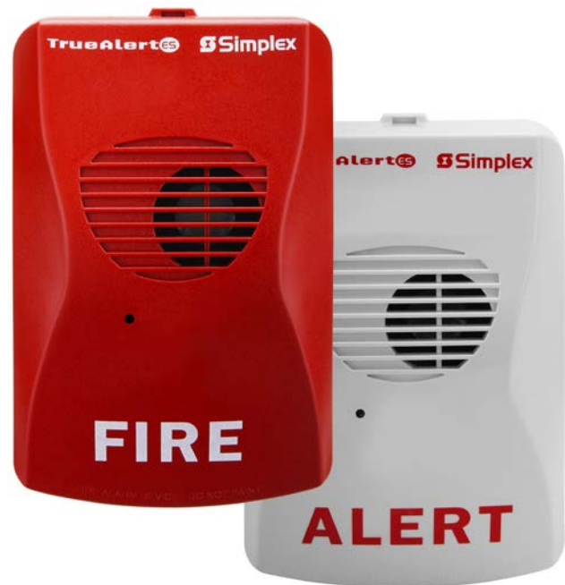
TrueAlert ES 59AO series Addressable Horns are Available in Red with White Lettering and White with Red Lettering