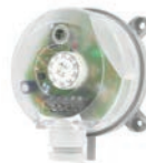
Bypass Damper version is available online