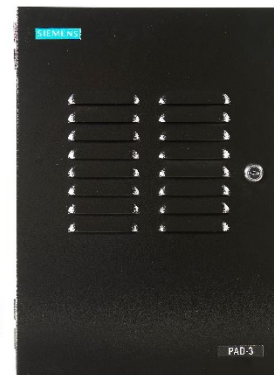
Model EN-PAD Black Enclosure for PAD-3 unit