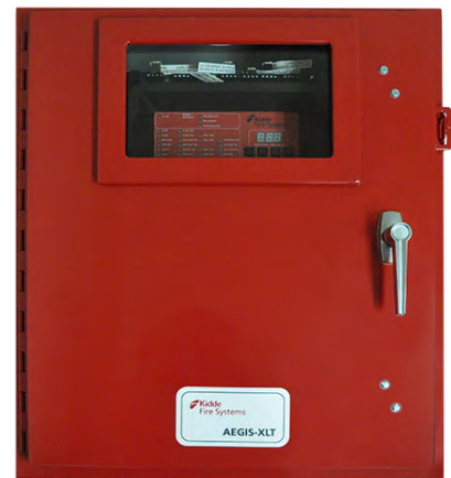
AEGIS-XLT (NEMA 12)