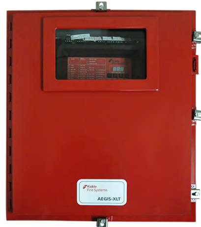
AEGIS-XLT (NEMA 4)

For Commercial, Outdoor (Weatherproof) and Industrial (Dust Tight and Oil Resistant) applications, the AEGIS-XLT is available in NEMA 4 and 12 versions. The NEMA 12 enclosure has a door mounted handle for easy access.