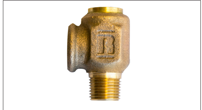
Model A Relief Valve Ports and Dimensions Figure 1