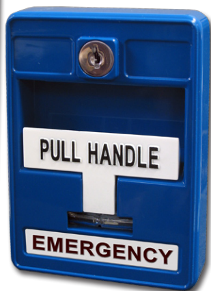
MS-703U Blue Single Action Manual Station