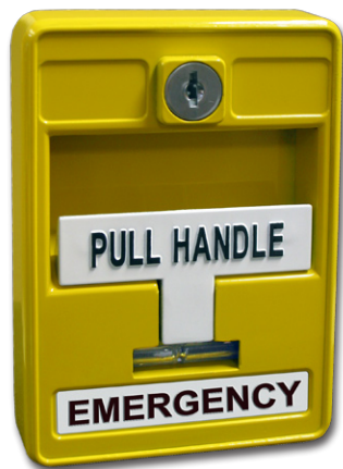
MS-704U Yellow Single Action Manual Station